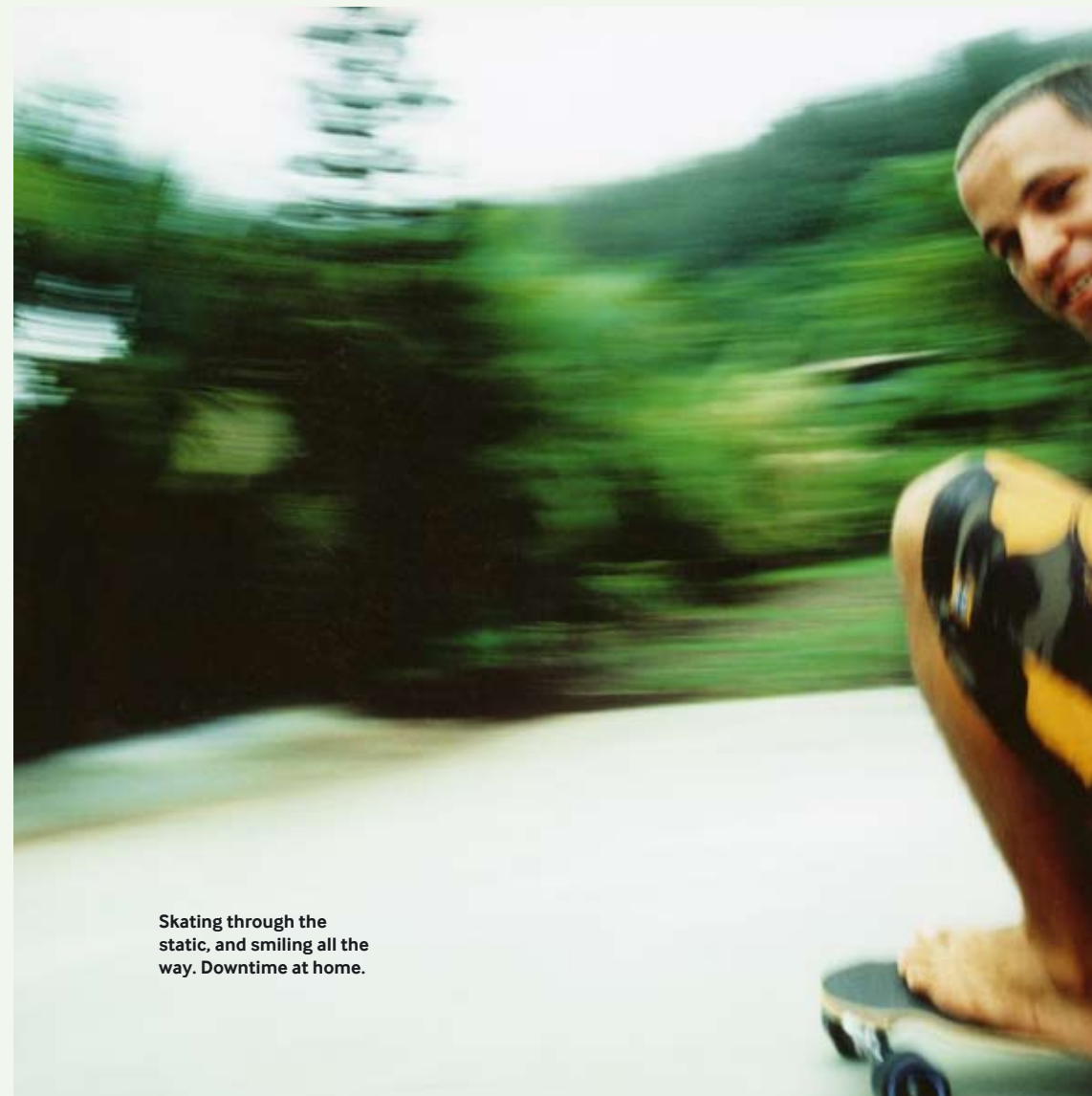
Skating through the static, and smiling all the way. Downtime at home.

It would have been at The Mint here in LA. It came