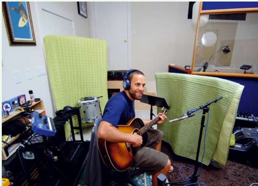
Above: Recording in the LA house Jack and his partners converted for Brushfire's mainland operations. Like his recording studio at home in Hawaii, it's solar-powered and remodeled using as much recycled material as possible. Below: Jack outside the new studio, aka the Solar Plastic Power Plant, LA.

came out in 2003, followed by In Between Dreams in 2005. In 2006, he released the soundtrack to the animated film Curious George , which went to #1 on Billboard's Top 200 and Rock Album charts.